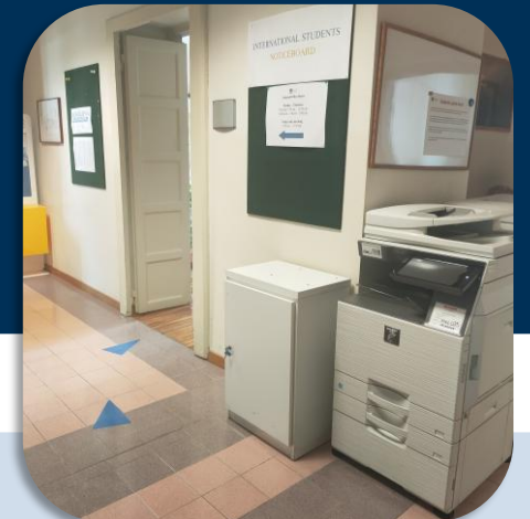
International Office Via Carducci 30, 3 rd floor

----- Find us in the office Or on TEAMS!